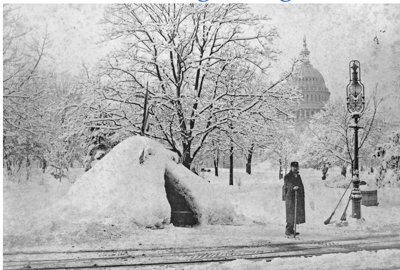
A street-side snow hut made after the Great Blizzard of 1888 in D.C.